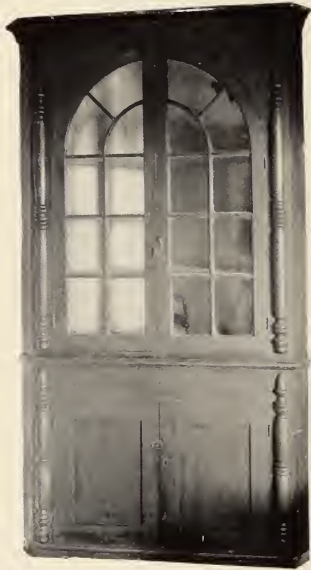
OLD CORNER CABINET WITH THE ORIGINAL GRAINING